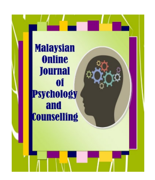
Volume 9 (2), December 2022

Keywords: Marital Satisfaction, Social Support, Personality, Neuroticism, Dual Earners