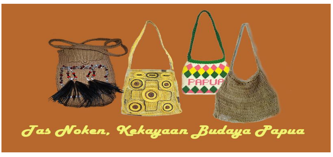
Figure 3: Noken Bag

for making noken in Papua. For the Papuan people, noken is material and becomes something that is interpreted as a symbol of a good life, peace, and fertility. In addition, noken in Papuan philosophy refers to an attitude of independence and help.<sup>22</sup> The data on the quantity of Muslims in Jayapura, based on the census of the BPS (Central Bureau of Statistics) Papua Province, after the 1998 reformation of Muslims in Jayapura Regency, in 2010 the percentage of Muslims in Jayapura was 29,188 Muslims out of a total population of 111,943 people, Protestants numbered 76,610, Catholics 4,675, Hindus 330, Buddhists 116, and Confucians 9 people.<sup>23</sup>