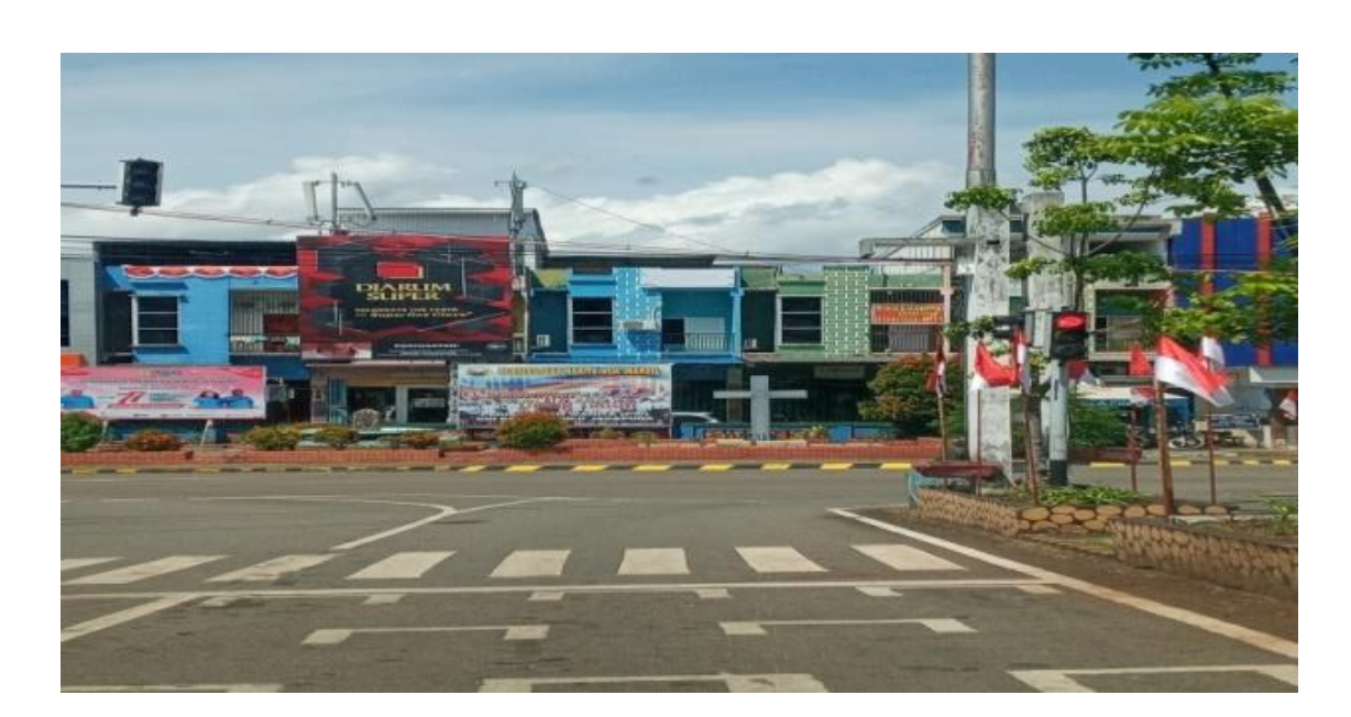
Figure 4: Cross Symbol on the Road to Jayapura City

The issue of Islamization has forced hardline Christians to use symbols and labels of their religion in every corner of the space in Jayapura City. This condition was further strengthened by the demand for Papuan independence, after 1998 a stigma emerged that Papuan nationalism was identified with people who were Melanesian and Christian. As for non-Papuans (descendants of immigrants) who are mostly Muslims, they are branded more pro-Indonesian, thus giving rise to racial arrogance which is united with religious labels such as Papuans being identical to Christians, in addition to the emergence of a prerogative attitude of ethnic Papuans where ethnic Papuans feel more entitled in Papua. and the immigrant community becomes second class even though the immigrant community has been living for 50 years.<sup>47</sup>