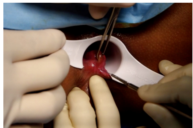
Figure 3: Incising the dentate line