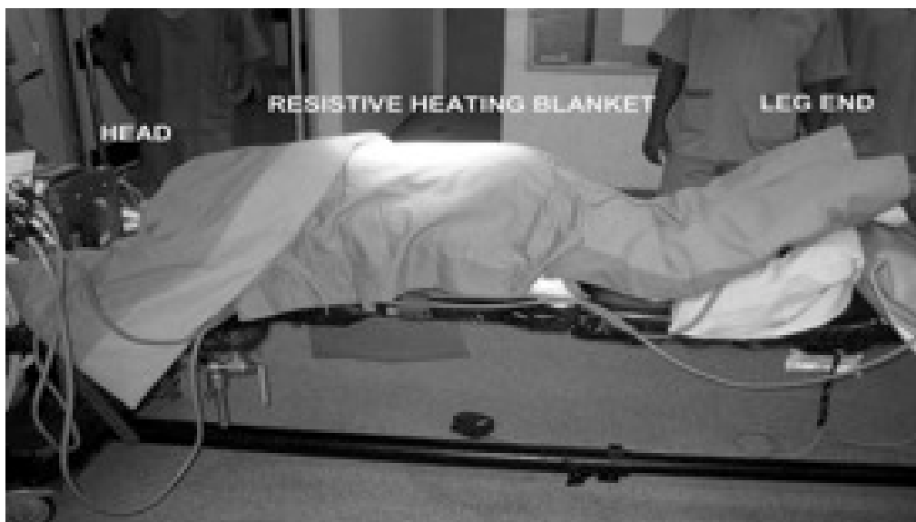
Figure 1: Picture showing the application of resistive heating blanket on patient during spinal surgery.