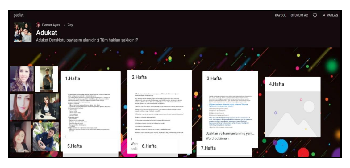
Figure 3: An example of a Padlet wall_1