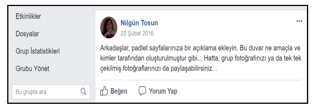
Figure 1 and Figure 2 show screenshots of the instructor making announcements on Facebook and sharing material. Figure 3 and Figure 4 show two examples of Padlet walls created by student groups.