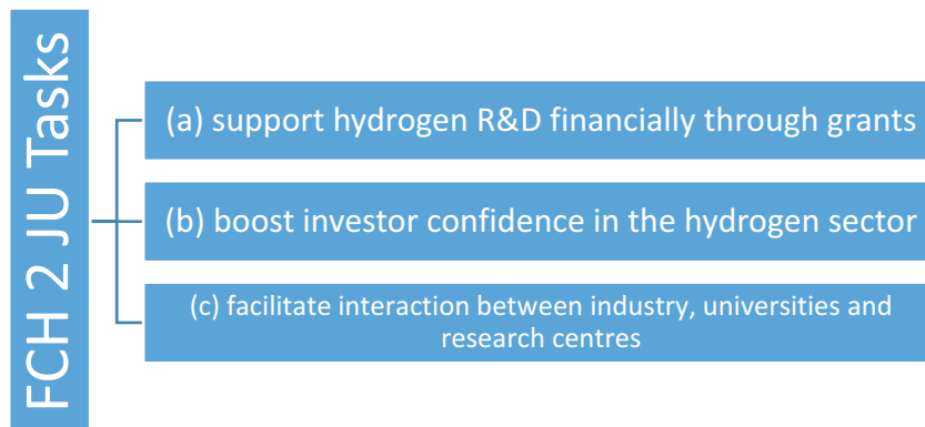
Fig.1 Tasks of the FCH 2 JU (EU, 2014)

To address these issues, the EU established the Fuel Cells and Hydrogen 2 Joint Undertaking (FCH 2 JU) (EC, 2017; EU, 2014), which is tasked with implementing public-private partnerships for hydrogen research to develop “strong, sustainable, and globally competitive fuel cells and hydrogen sector in the Union” and reducing the costs of hydrogen and fuel cells (EU, 2014). The three most relevant FCH 2 JU tasks are displayed in Fig.1: