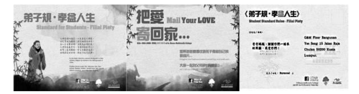
Figure 4. Front and back of the postcard

Apart from the postcard, the team also created a Facebook page that users could access by typing "Filial Piety," or the direct link: "facebook.com/FilialPiety" This provided a communication platform for those who were interested in learning more about their campaign as well as about Di Zhi Gui . The Facebook page also shared some wall photos or links from other websites. Within a week of being launched on 16 April, 2012, the page had accumulated 70 "likes." These findings suggest that a methodology designed to evoke the positive thoughts and values that are intrinsic to the philosophy of great thinkers within the learning process benefitted learners. Moreover, the learning process of the students inspired a positive response from 72 percent (152 out of 211) of Malaysian Chinese end users, who subsequently handwrote a few words expressing their love on the greeting cards and posted them the traditional way (see Figure 5). This seldom happens among the Chinese in Malaysia. The salience of the final outcome is not so much about the appearance of the final design; rather it is the transmission of traditional Chinese values of filial piety and respect to inculcate the virtuous and service to others as a leadership qualities.