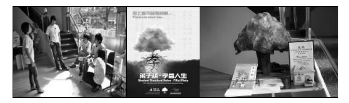
Figure 3. Brainstorming session, poster design and display setting.

An A5 size postcard was designed, depicting an ancient Chinese sage (representing a guru), who reminds the user to repay his or her parents' love. The card's caption was: "Standard for Students: Filial Piety for Your Entire Life." The 'students' in this caption was a broad reference to all, and filial piety was to be shown to people older than oneself. In the center of this postcard was a Chinese poem about the duty of a son. The English translation of the poem is as follows: "In the family hierarchy, parents are superior to their children. Respect for parents is the starting point of virtue. Children should model their behavior after their parents. Besides, children should honor their parents without complaint, even when they disagree." On the back of the postcard was a bilingual heading: "MAIL YOUR LOVE," aimed at encouraging people to write a short message expressing their love toward their parents on the postcards.