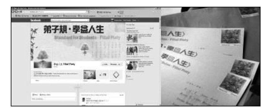
Figure 5. Facebook profile page and postcards ready for mailing.

Apart from the postcard, the team also created a Facebook page that users could access by typing "Filial Piety," or the direct link: "facebook.com/FilialPiety" This provided a communication platform for those who were interested in learning more about their campaign as well as about Di Zhi Gui . The Facebook page also shared some wall photos or links from other websites. Within a week of being launched on 16 April, 2012, the page had accumulated 70 "likes." These findings suggest that a methodology designed to evoke the positive thoughts and values that are intrinsic to the philosophy of great thinkers within the learning process benefitted learners. Moreover, the learning process of the students inspired a positive response from 72 percent (152 out of 211) of Malaysian Chinese end users, who subsequently handwrote a few words expressing their love on the greeting cards and posted them the traditional way (see Figure 5). This seldom happens among the Chinese in Malaysia. The salience of the final outcome is not so much about the appearance of the final design; rather it is the transmission of traditional Chinese values of filial piety and respect to inculcate the virtuous and service to others as a leadership qualities.